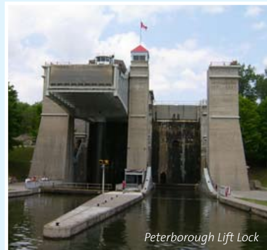
Peterborough Lift Lock

The Trent-Severn Waterway flows 386 km across Central Ontario connecting with over 100 small and large lakes. Flowing through Peterborough, it includes The Peterborough Lift Lock which is the largest hydraulic lift lock in the world.